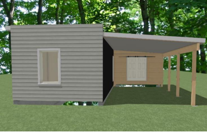
Renderings of modular home with improvements