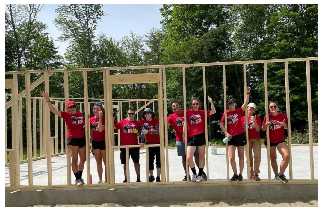
The Bike & Build Crew on Site in mid-June

On June 15, a group of 9 Bike & Build volunteers kicked off our build season with a day of framing at the Lebanon home site. This group of 21 young adults from across the country raised $5,000 each to bicycle from Portsmouth, NH to Bellingham, WA and volunteer on affordable housing projects along the way.